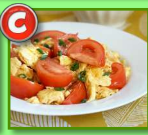
Tomato and egg